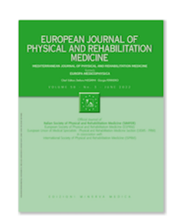
European Journal of Physical and Rehabilitation Medicine

You have access to online journals using your OpenAthens details. You can browse journals using the NHS Knowledge and Library Hub . Here are some of the journals available to you: